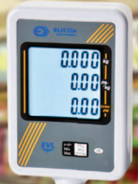
EVLplus xx LT